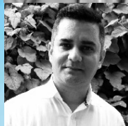
22 JUNE 21 TUE THE PROCESS OF CREATIVITY by Anuraag S Creative Head, ARCH