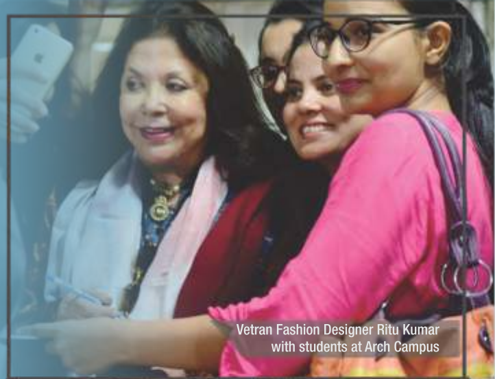
Vetran Fashion Designer Ritu Kumar with students at Arch Campus

Arch is a well recognised and established name in the Design World and often witnesses the arrival of many industry stalwarts like Ritu Kumar, Anita Dongre, Sabyasachi & Bollywood Stars like Randeep Hooda, Parineeti Chopra, Anushka Sharma, etc.